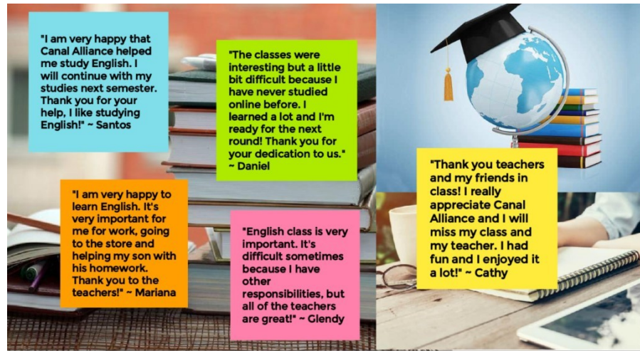
JamBoard created by the ESL Level 200 class

On December 3rd, the ESL program staff, volunteers and students celebrated the successful completion of its Fall 2020 Semester. The semester's completion represented a remarkable accomplishment as staff quickly pivoted to offer a pilot semester of the program through virtual learning. After providing students with Chromebooks and ensuring they had access to the internet, staff and volunteers helped students learn to access and navigate a new online platform to ensure that students could continue to advance their English skills despite the shelter in place orders.